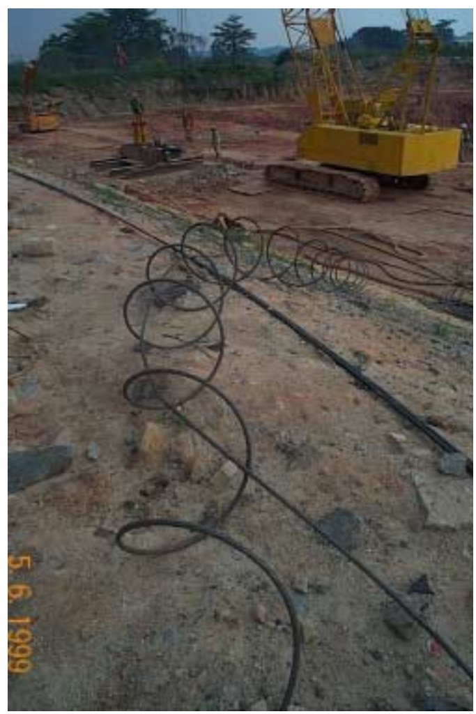
Photograph 2. Extracted strand of a removal anchor.