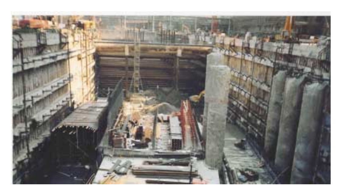
Photograph 3. 200-tonne working capacity multiple anchors at Central Station in Hong Kong.