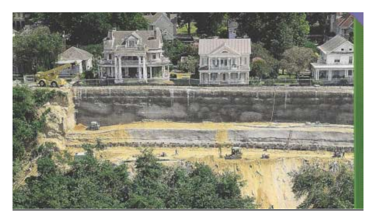
Photograph 5. High capacity SBMAs in difficult "loess" soils in Natchez, MS.