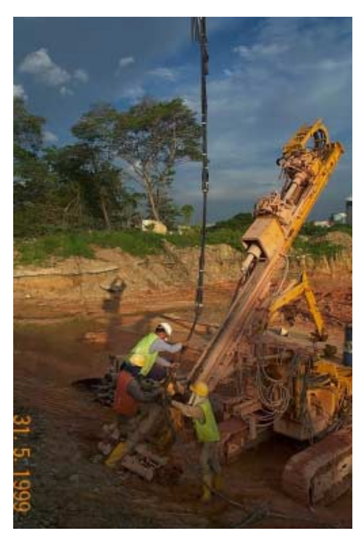
Photograph 1. Looped strands of removable SBMAs.