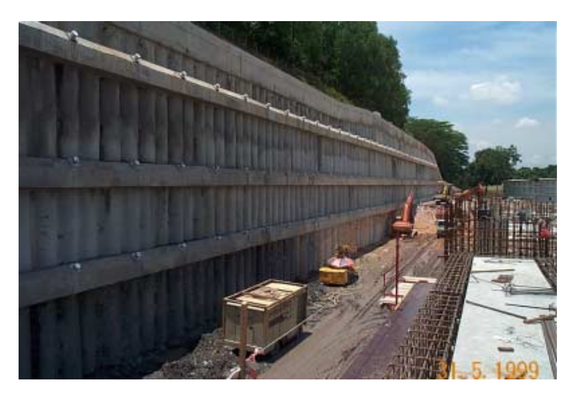
Photograph 4. 150-tonne working load anchors allowed the original number of 80-tonne anchors to be reduced by half.